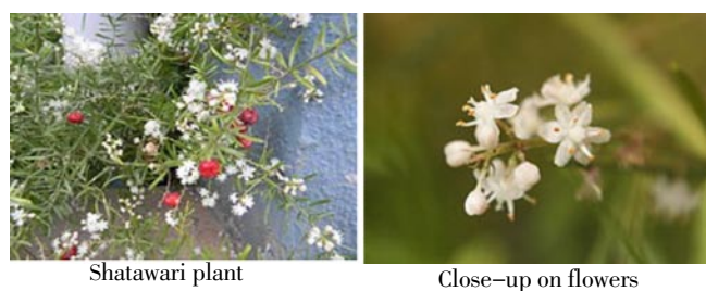
Figure 1. A. racemosus .

A. racemosus is common throughout Sri Lanka, India and the Himalayas. It grows one to two metres tall and prefers to take root in gravelly, rocky soils high up in piedmont plains, at 1300–1400 m elevation[10,11]. Some plants parts are given in Figure 1.